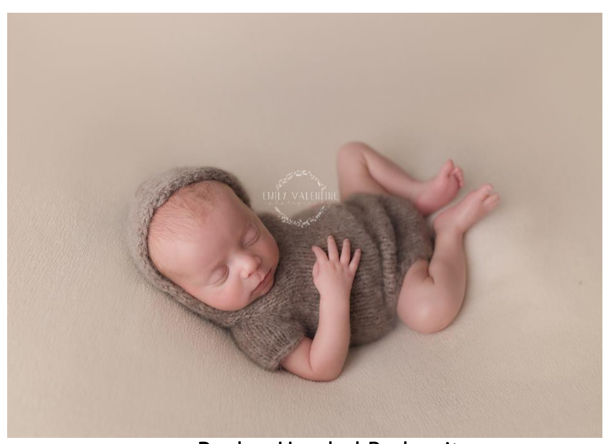
Raglan Hooded Bodysuit Pattern Design by - Amanda Morse

Materials - 160-220yds of worsted weight yarn (I used Plymouth Yarn Baby Alpaca Brushed), size 7 (4.5mm) 16ins circular needles, 4 stitch markers, yarn needle, crochet hook (for provisional cast on)