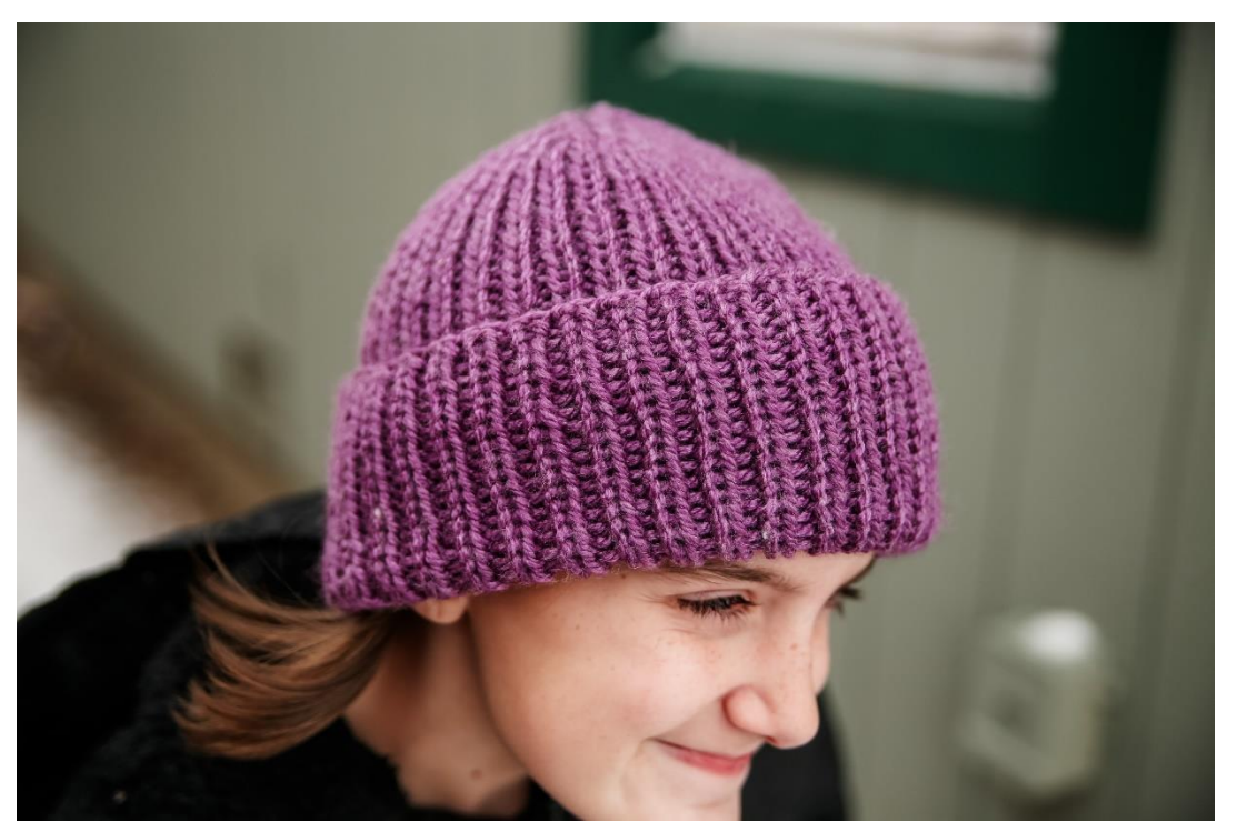
Size newborn, baby (toddler, child) adult small, adult large